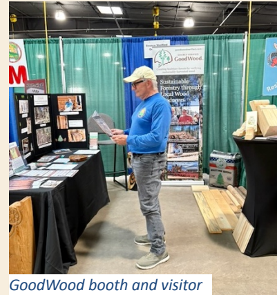
GoodWood booth and visitor